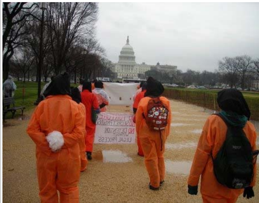
Protesters at the D.C. March to Close Guantanamo and to End Torture demonstration.