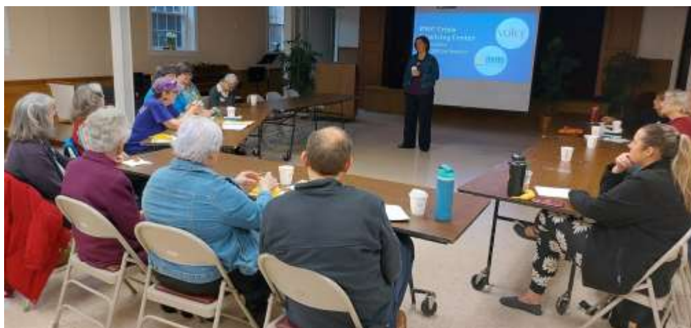
Photo from: VOICE CRC outreach session co-sponsored by BRUU at Church of the Brethren

As a member of Virginians Organized for Interfaith Community Engagement (VOICE - https://voice-va.org/ ), BRUU has been active in advocating for state and local funding to open a Crisis Receiving Center (CRC) in Woodbridge at Potomac Mills. Governor Youngkin was impressed last year when VOICE gathered 800 people in Triangle. He supported the General Assembly approval of $140 million to create nine CRC's across Virginia.