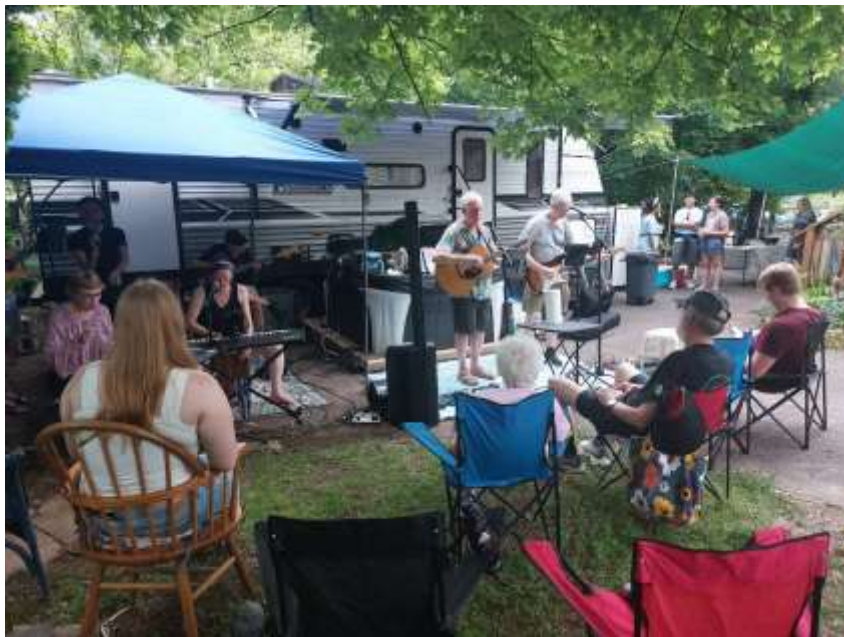
From the 2025 BRUU Annual Picnic