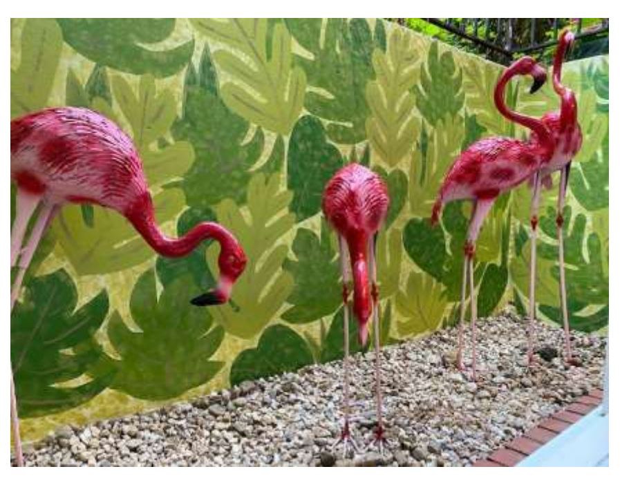
Photo: The residents of BRUU's Flamingo Lounge, looking bright and summery after a recent refresh