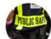
Public Safety Comm.