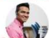
Walmart Service Ass.