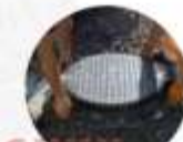
Water & Sewer Worker