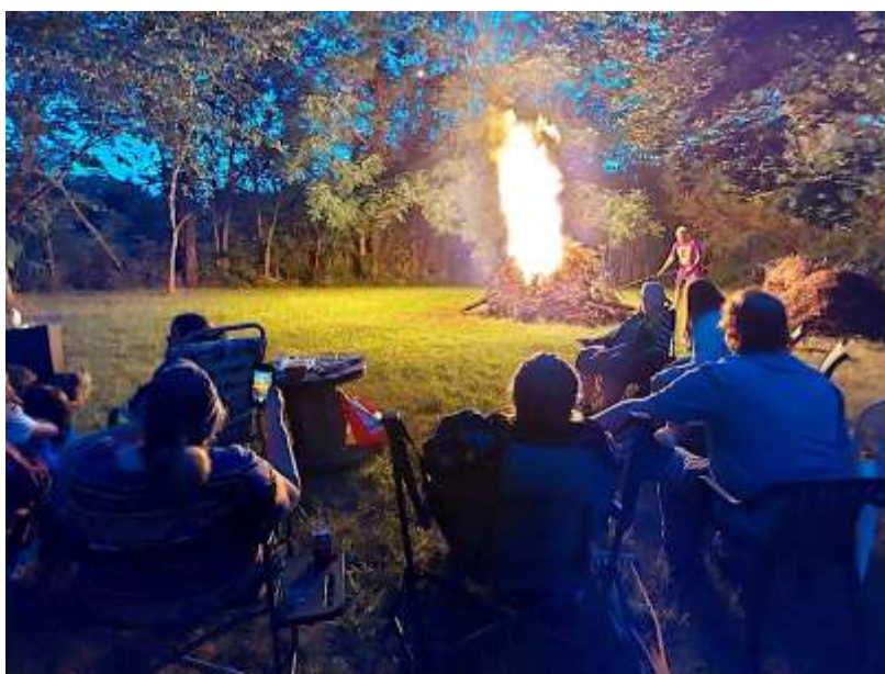
From the 2024 Annual BRUU Picnic