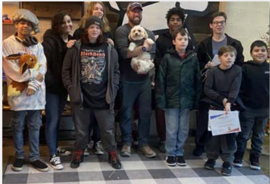
Homeschoolers of Bealeton