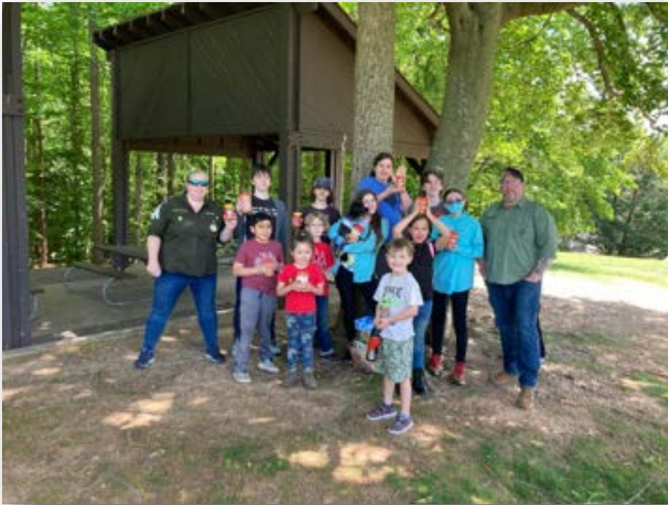
17th Black Bears of OSG Scout Group